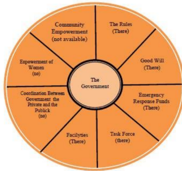
Figure 1. PUG The implementation component of the role of women in the face of climate change