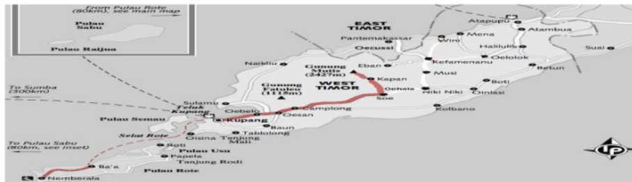
Figure 2. Map of the Kupang - West Timor Corridor Research

Research design. The scope of this research includes community-based tourism consisting of social, cultural, economic, environmental and political aspects as well as the marketing strategies of tourism products (segmentation, targets and market positions). The object of research is the Kupang - West Timor corridor which is the border of NTT and the State of Timor Leste, (Figure below):